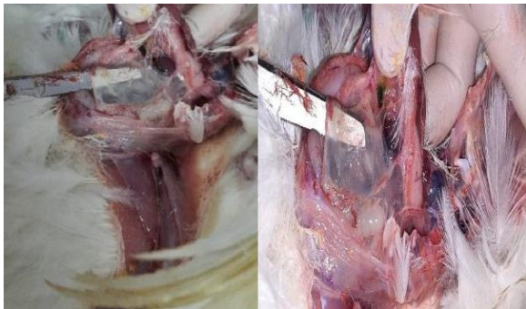
Fig. 3: Photograph showing turbid air sac of non-vaccinated chickens.

The immune response of immunized turkey poult against MS is shown in Table 4. The antibody titer against MS in the inactivated combined MG-MS vaccine in group 1 increased in the second and third week following the first vaccination, reaching 32 and 64 respectively, and increased to 512 after three weeks from the second vaccination. However, the titer remained 0 in the control group.