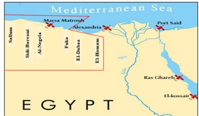
Fig. 1: Different localities in Matrouh Province where animal samples and human samples were collected.

of antibodies among different groups studied according to SPSS 16.0 according to Norusis (2008). A probability value P < 0.05 was considered significant statistically.