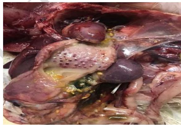
Fig. 2: Hemorrhages at proventriculus tips and congested spleen of chicken carcass naturally infected with velogenic NDV.