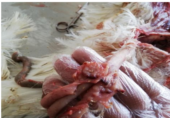
Fig. 1: Hemorrhagic and inflamed cecal tonsils in white turkey naturally infected with velogenic NDV.

The investigated isolates were obtained from birds presenting clinical signs and lesions suggesting NDV infection. From the 20 confirmed NDV isolates by RT-PCR, six isolates were selected for partial Fusion gene sequence. The amplified amplicon was approximately 400bp. This segment was purified, sequenced and aligned with corresponding reference NDVs strains representing different genotypes at different geographical locations. The analysis of the selected partial F gene showed the six isolates have polybasic deduced amino acid sequence at cleavage site and the motif was 112 GRRQKR↓F 117 of Fusion protein, which is a characteristic property for velogenic NDVs. The phylogenetic analysis indicated that all investigated isolates were clustered with class II genotype VIII.1 NDVs (Fig. 3). The lowest identity between the investigated isolates was 96.1% between Quail/Egypt/Giza-ZU-16/2019, Pigeon-Sharkia-ZU-9-2020 and Chicken-Qalubeya-ZU-10-2020. The nucleotides