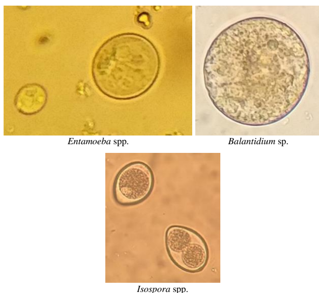
Fig. 4: Protozoa from long-tailed macaque in Bali.

Table 4 shows that habitat characteristics have a highly significant effect (P<0.01) on the infection rates of Strongyloides spp., Dicrocoelium spp., Diphylobothrium spp., Entamoeba spp., Balantidium spp., and Isospora spp. It also has a significant effect (P<0.05) on the infection rate of Taenia spp. However, it did not have a significant effect (P>0.05) on the infection rates of Ascaris spp. and Trichuris spp.